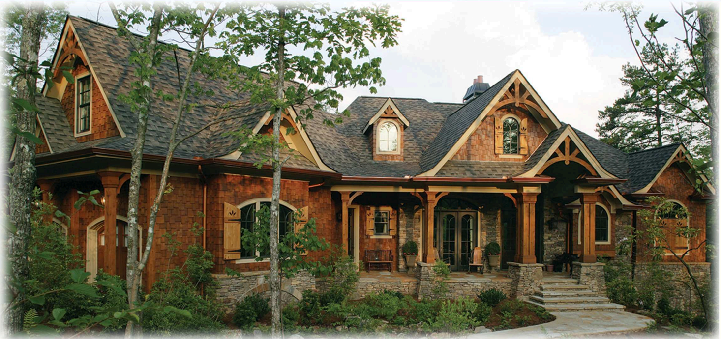
Photograph / Rendering altered per Floor Plan.